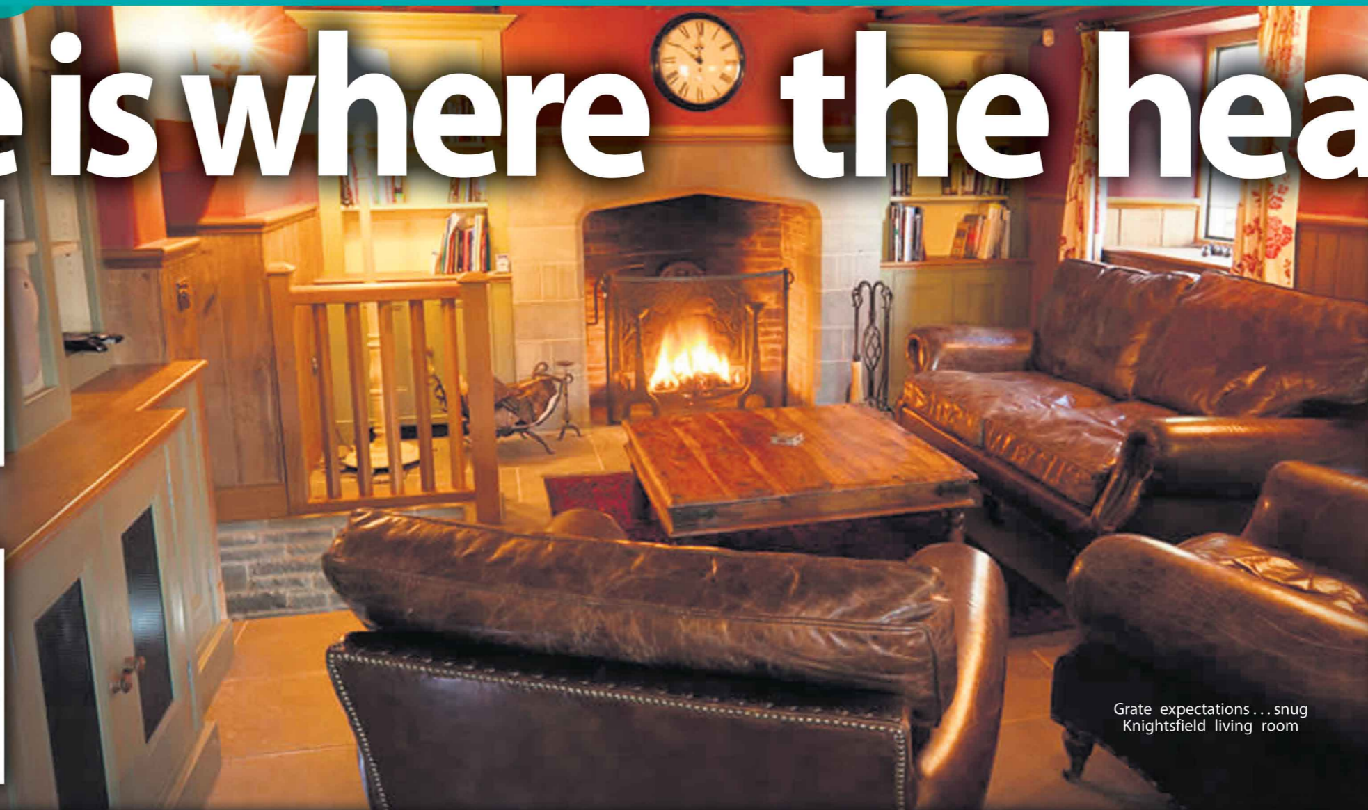
Grate expectations... snug Knightsfield living room