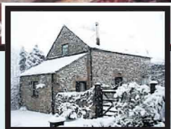
Cracker... Christmas Cottage in the Peaks