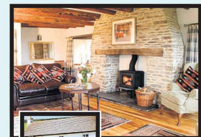
Cornish dream... Treworkey des res

Weekly rental starts from £364 and short breaks are available on request. See premiercottages.com