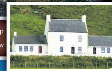
Snug... Lydia, top Drumore, right, and Crovie, below