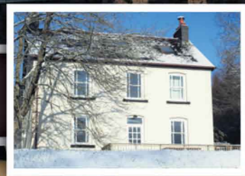
Cosy... Knightsfield, top, and, left and below, lovely Lletty